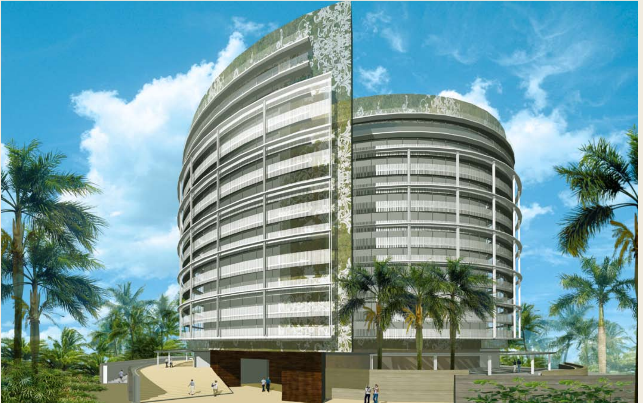
CIRCULAR APARTMENT BUILDINGS