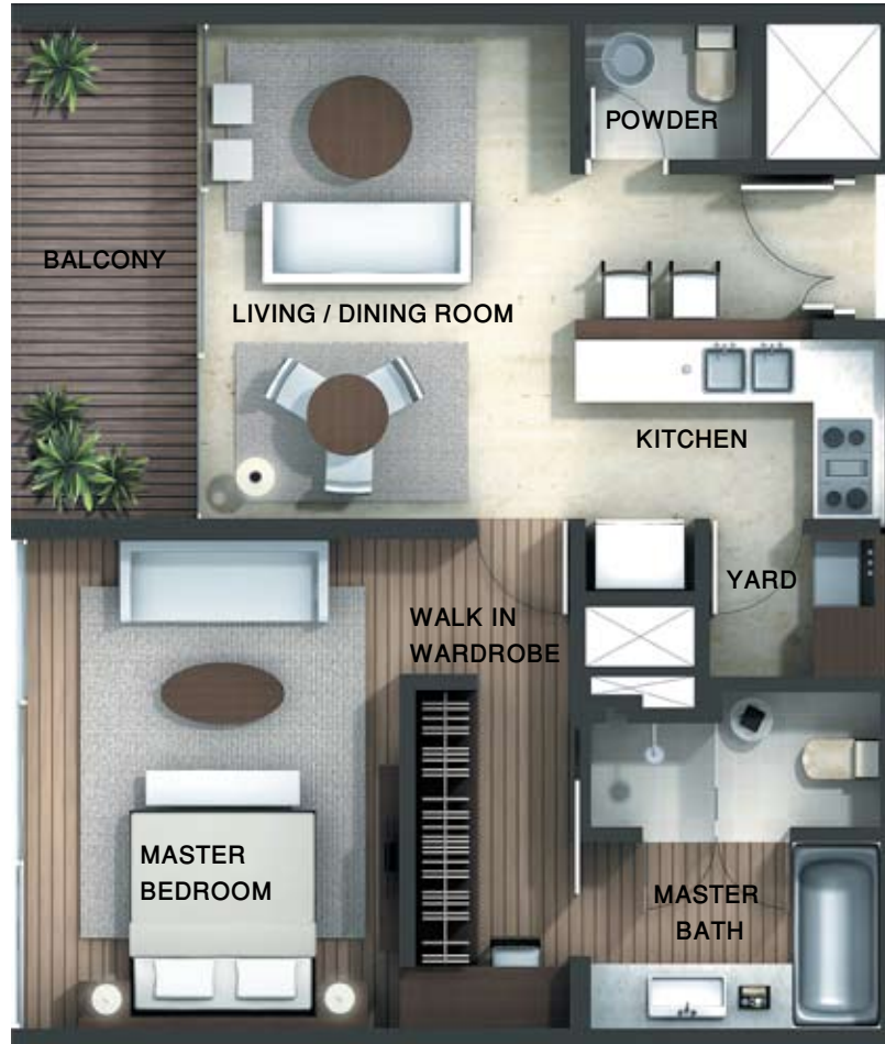
(A TYPICAL 1 BEDROOM APARTMENT)