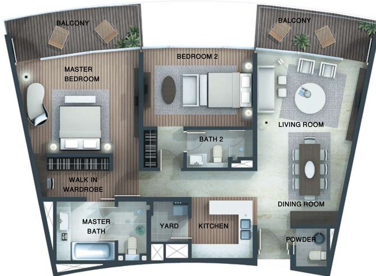
(A TYPICAL 2 BEDROOM APARTMENT)