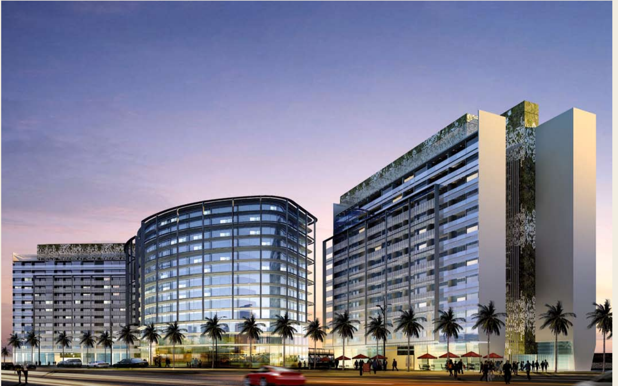
LINEAR APARTMENT BUILDINGS