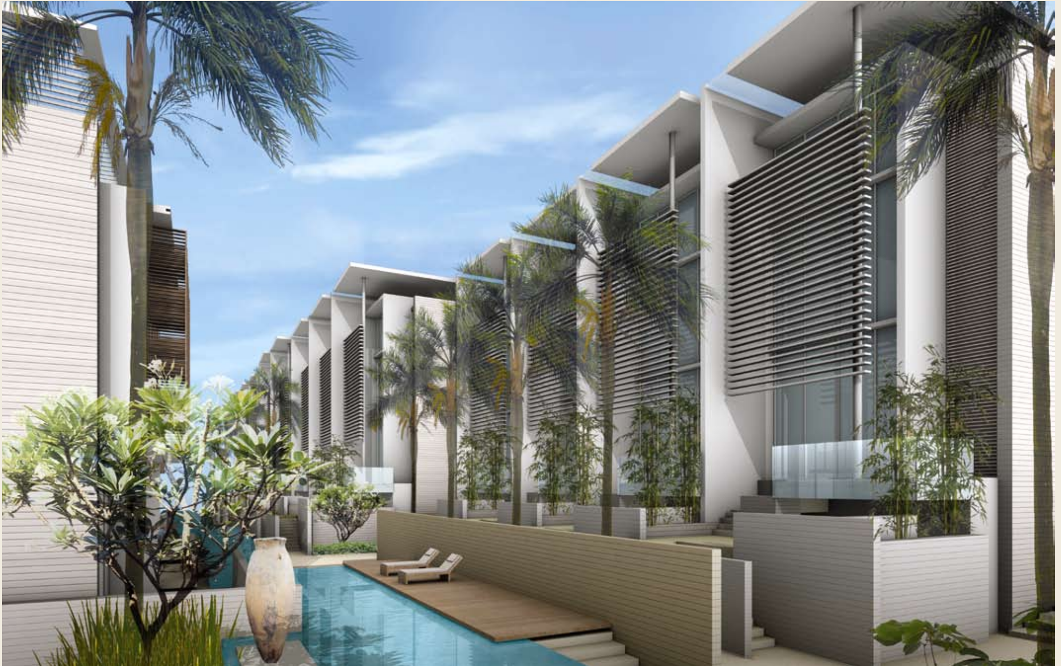
4 BEDROOM TOWNHOUSES